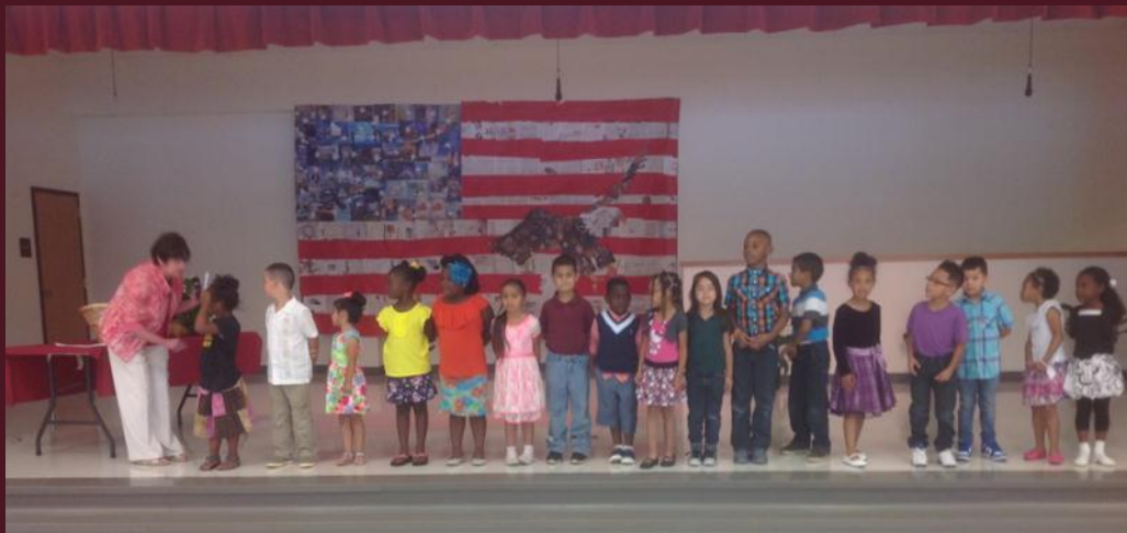
Sharing a Kindergarten Memory book with parents at Graduation